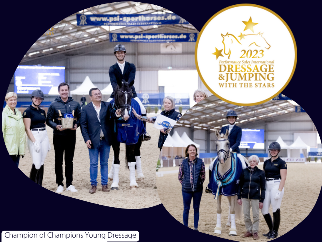
Champion of Champions Young Dressage Horse (top) and Pony (bottom).

P.S.I. Dressage and Jumping with the Stars has come to a close for another year. This event has grown to be the largest multi-discipline event in Australia, with competitions for young dressage horses, jumping horses, eventing horses, and performance ponies. This year's event saw impressive performances from riders and their equine partners.